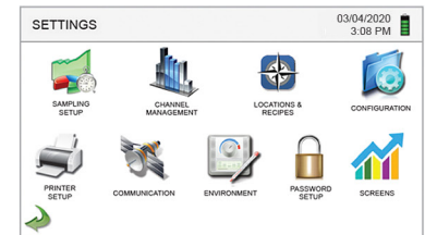
Icon Driven Menus for Ease-of-Use